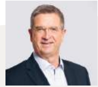
Oliver Zipse Chairman of the Board of Management of BMW AG